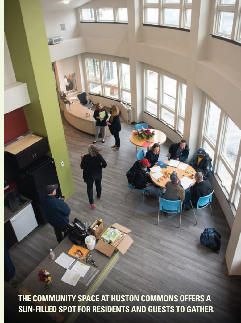
THE COMMUNITY SPACE AT HUSTON COMMONS OFFERS A SUN-FILLED SPOT FOR RESIDENTS AND GUESTS TO GATHER.